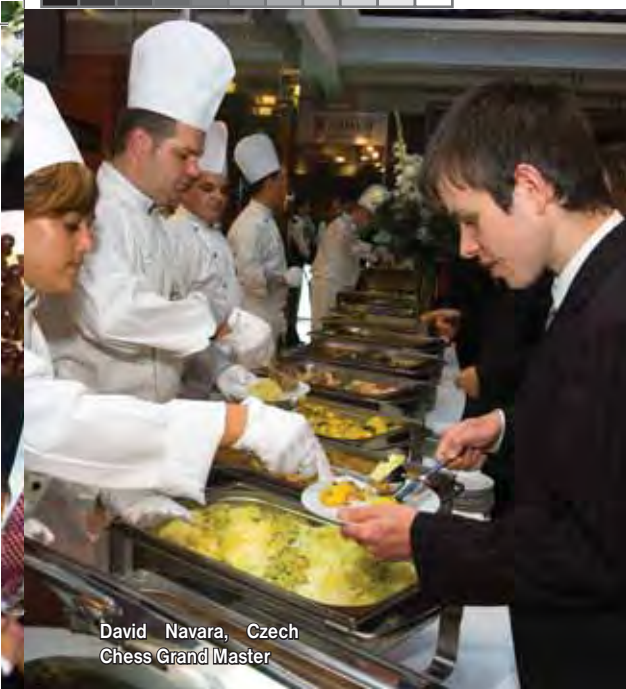
David Navara, Czech Chess Grand Master